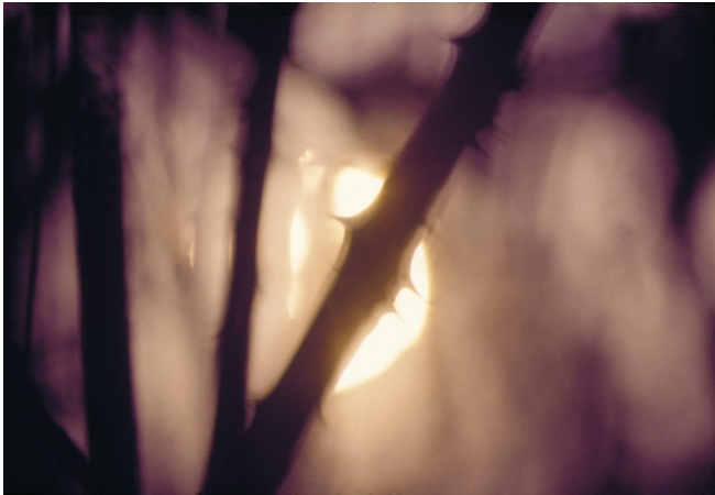
John Blakemore, Early Colour – 1963-1968