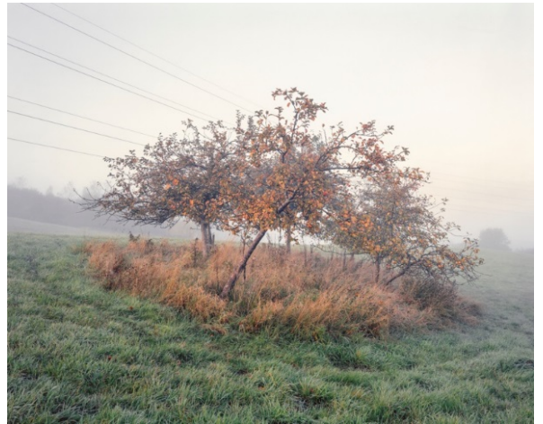
Joseph Wright, The Lost Forest